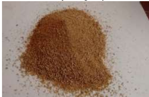
Fig. 3: Sand

Uncrushed natural river sand is used as fine aggregate in this investigation .As per IS 383:1970 fine aggregate properties were tested and concluded that the fine aggregate in this investigation falls in zone-II .The water absorption capacity is 1%, fineness modulus is 2.60, specific gravity is 2.65.