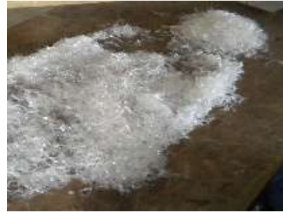
Fig.2:Waste PET bottle