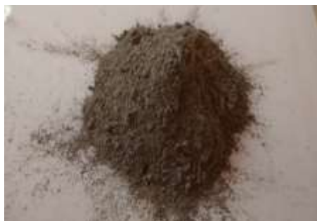
Fig. 1. Cement

The fineness of cement is 3%, specific gravity of cement is 3.13, standard consistency of cement is 31%, Initial setting time is 60 minutes and final setting time is 250 minutes.