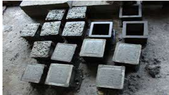
Fig. 4. Casting